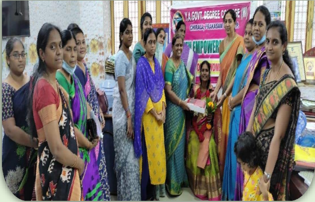
Felicitation to the Principal